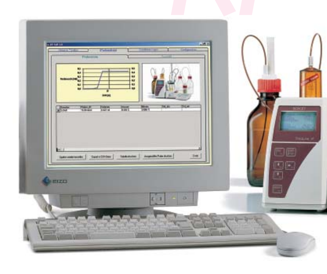
Using your PC and the titration software >KF-Soft<, you can also display your KF titrations as curves. All results can be reliably documented in the database integrated in the PC and retrieved at will.

To document your results, you can connect a printer, such as the TZ 3460, to one of the two RS-232-C interfaces. For documentation of your results, you can choose to print the results in standard, brief or GLP form. The GLP documentation includes the consumption, result, statistics, originally weighed quantity/submitted quantity, date, time, sample ID, titre, blank value, drift, titration period, method used, titration parameter, calculation formula with values used and an addition input field for the user.