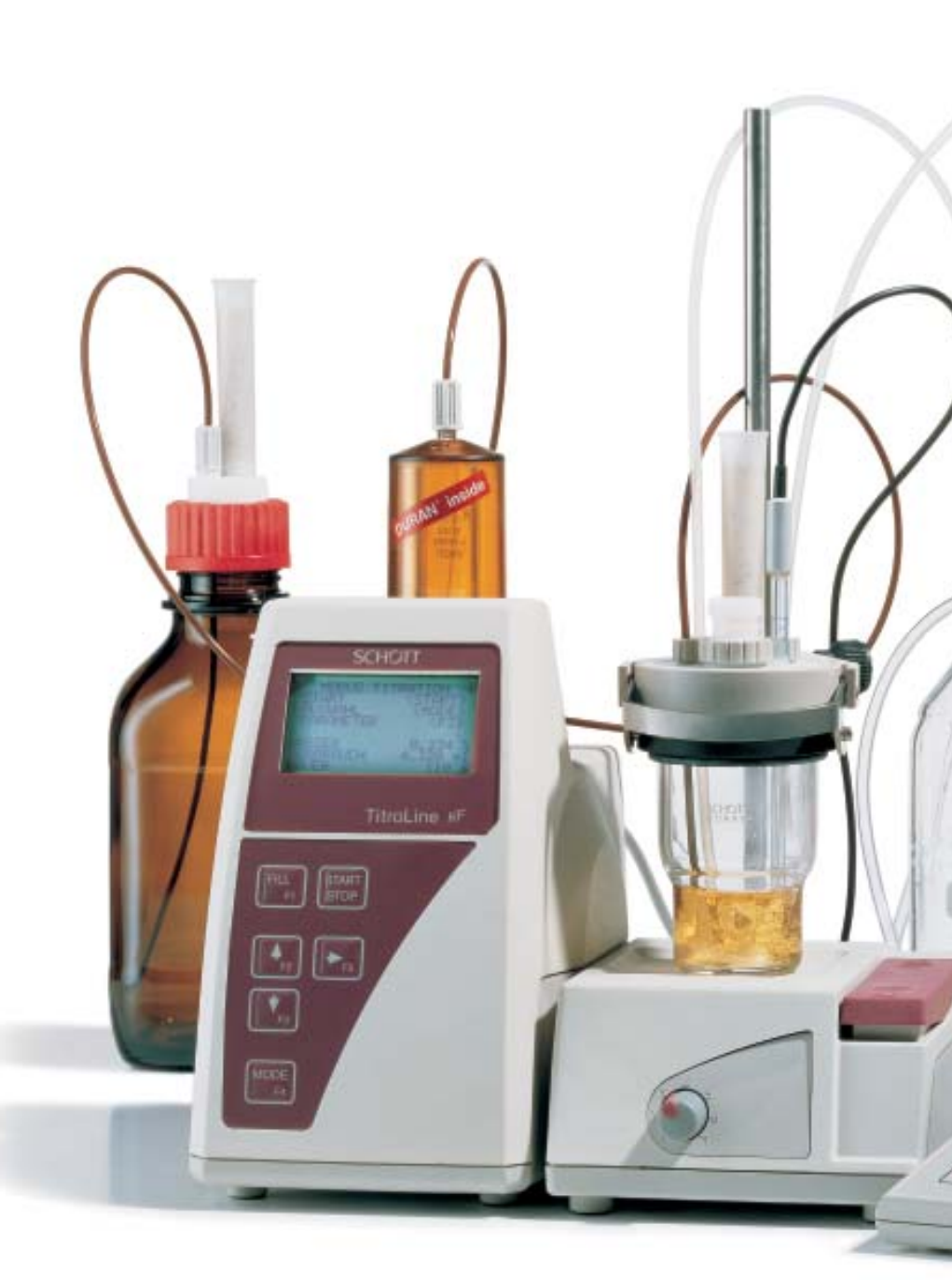
The TitroLine KF includes everything you need for water analysis according to Karl Fischer. The scope of supply includes the titrator, reagent bottle, titration stand TM KF, titration vessel, electrode and a starter kit (6 syringes with tubular needles, molecular sieve and three ampoules with a water standard specification). The waterproof mini keyboard TZ 2825 is available as an optional extra.

The staff in our application laboratory are pleased to advise and assist you and will place the know-how they have gained through many years of practical work with KF titrations at your disposal. The application manual 'KF Titration in Practical Applications', which is enclosed with the TitroLine KF , puts some of this experience at your disposal. You will also find further applications in our application database at our Internet web site (www.schott.com/ labinstruments) where application data can be downloaded.